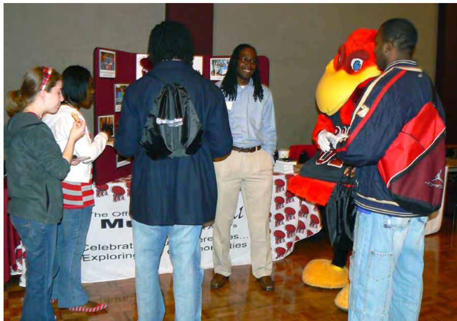
The University of South Carolina's Spring Major and Information Fair provides sophomores a one-stop information center.

Graduate Assistant National Resource Center for The First-Year Experience & Students in Transition University of South Carolina, Columbia, SC