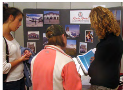
A sophomore obtains information on study abroad opportunities at the University of South Carolina Spring Major and Information Fair.

Although space is limited for the retreat, all sophomores are encouraged to apply, explaining why they want to attend and what they hope to gain from the experience. There is a nominal charge to attend the retreat, and the college has dedicated funds to cover the majority of costs and provide scholarships.