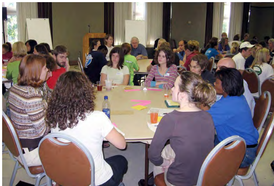
The first Mutual Expectations Event at Missouri attracted over 150 faculty and students.

The program has received strong support from both faculty and students who have benefited from participating in various ways.