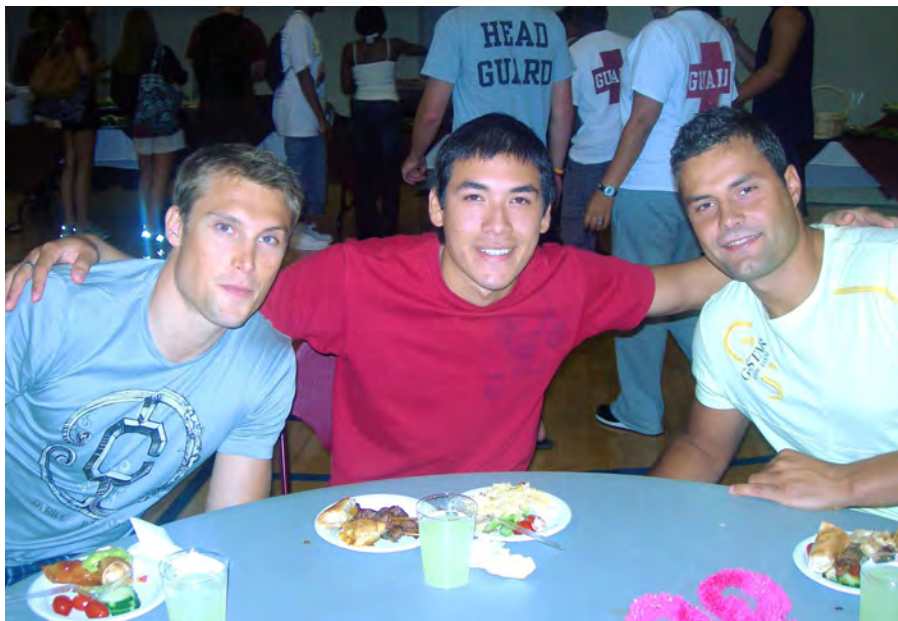
Sophomores had a chance to rekindle and start new friendships at the University of South Carolina's Sophomore Beach Bash.