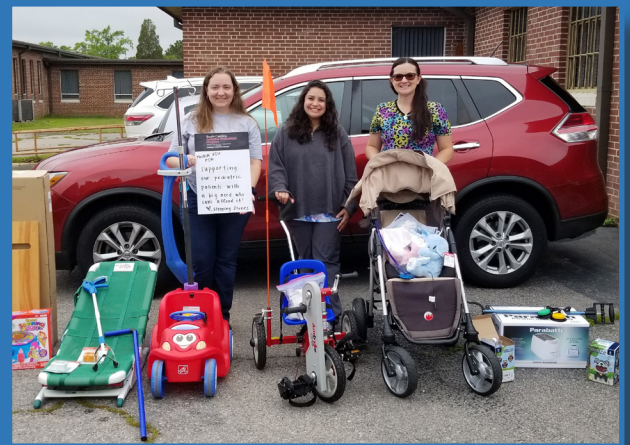
Therapists excited about finding equipment for pediatric patients at clinic.

33 people received 169 pieces of DME equipment at a savings of $26,894.