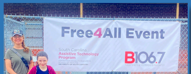
Thank you to BIO6.7 Radio for sponsoring this event.