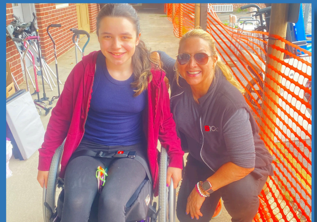
Young woman found the equipment she needed for use in her home.